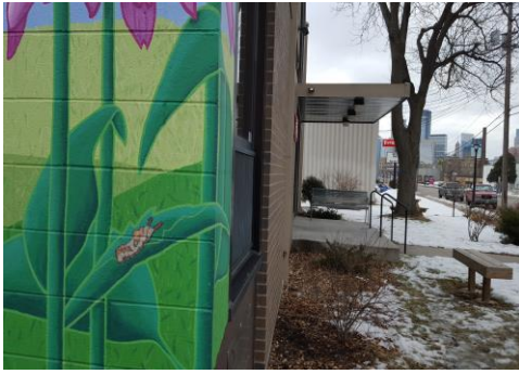
The Link, based in Minneapolis, provides services for exploited youth.

“The thinking is that every bad thing that happens wouldn’t be happening if you were still with your trafficker. If I was still prostituting, I wouldn’t have to worry about food stamps. I could get some shoes.”